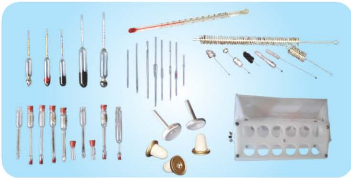
Milk Testing Equipment