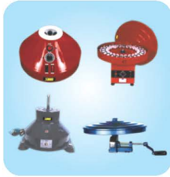
Hand and Electrical Operated Gerber Centrifuge Machine