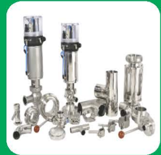
Flow Control Valve