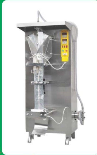
Milk Packaging Machine