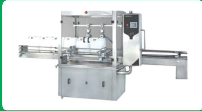
Cup Filling Machine