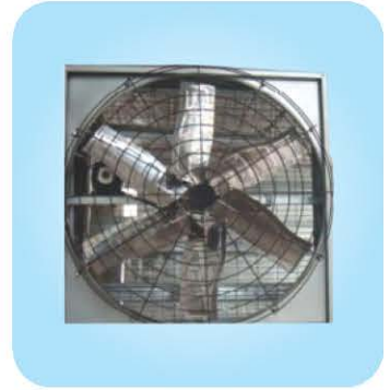
Dairy Ventilation Fan