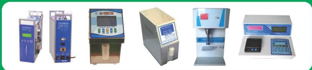
Milk Fat Testing Machine