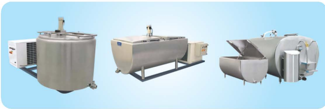
Bulk Milk Cooler