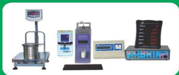
Automatic Milk Collection System